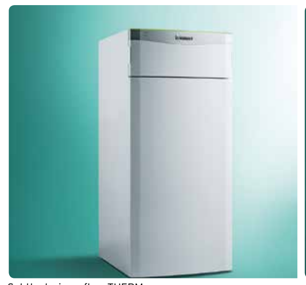
Subtle design - flexoTHERM