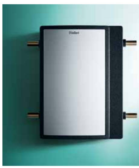
gent engineering - flexoTHERM